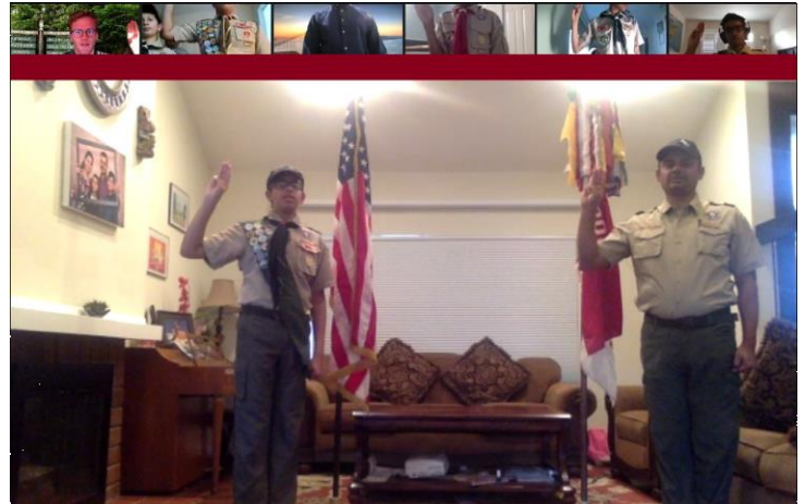
Troop 908 Court of Honor via zoom

Twinvalleyscouting.com website has updates regarding advancement as well as resources and ideas for continuing scouting at home during this time.