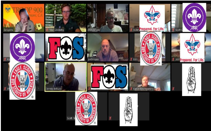
Troop 900 Friends of Scouting via zoom

We are now a part of the NEW GOLDEN GATE AREA COUNCIL